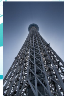
Tokyo Sky Tree (634m height)

Technical tour on epoch-making construction projects and on Japanese culture will be scheduled. Please wait for further information.